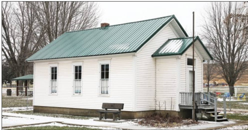
Pautsch purchased this schoolhouse, which was located near Battle Creek, in 1979.