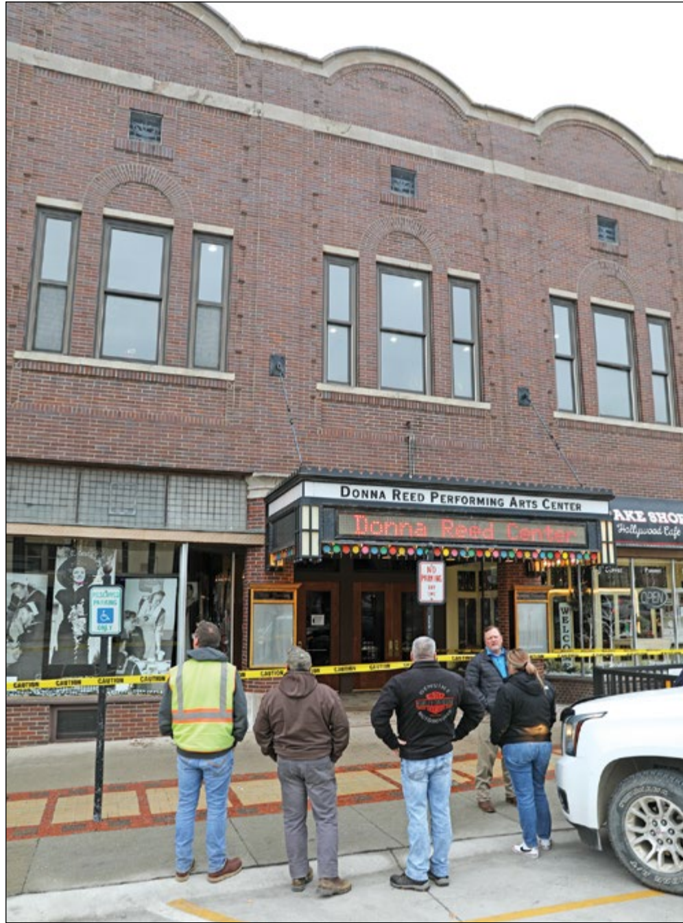
Representatives of the city and WESCO gathered at the theater and quickly cordoned off the area where more limestone seemed most likely to fall.