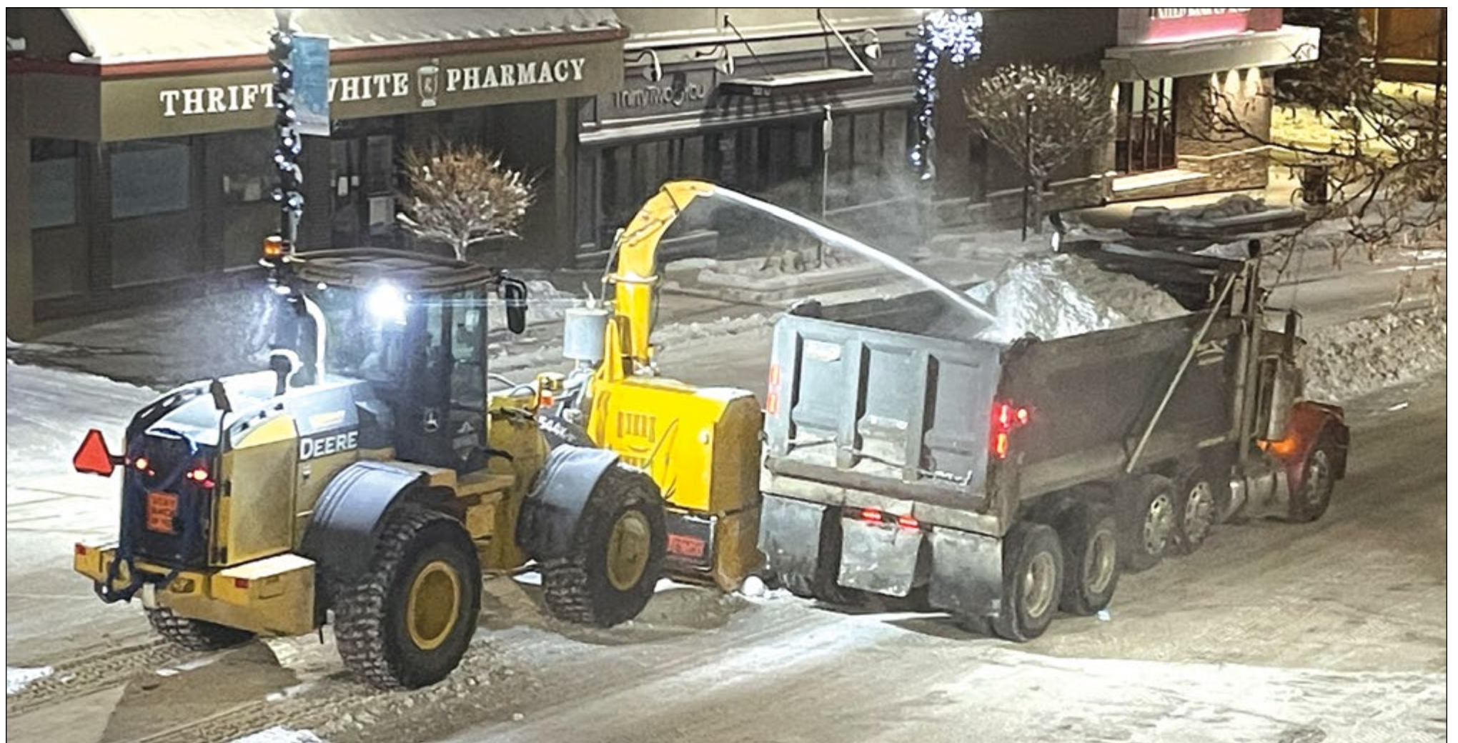
City crews were out in the dark early on Tuesday while snow was still falling to start the task of cleaning up snow from streets and parking lots. Early on Wednesday, the crews were back out to remove the long piles of snow from the streets.