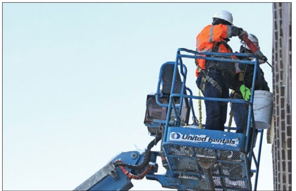
A crew from Williams Construction, of Omaha, began removing loose pieces of limestone on Wednesday morning.