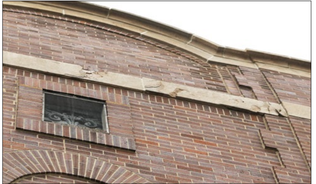
The area of damage is part of a decorative strip of limestone on the parapet of the theater building.