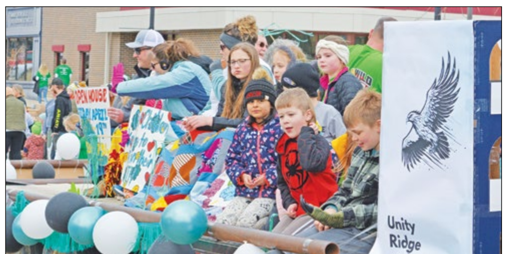
Students gather on the Unity Ridge float.