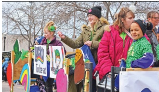
People wave to the crowd from the WESCO float.