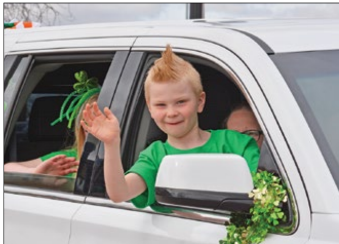
This young person decked out in green waves from the Polar Bear Rescue entry.