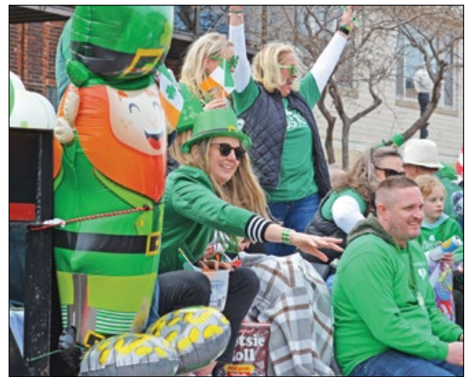
The Houston clan cheers from its float.