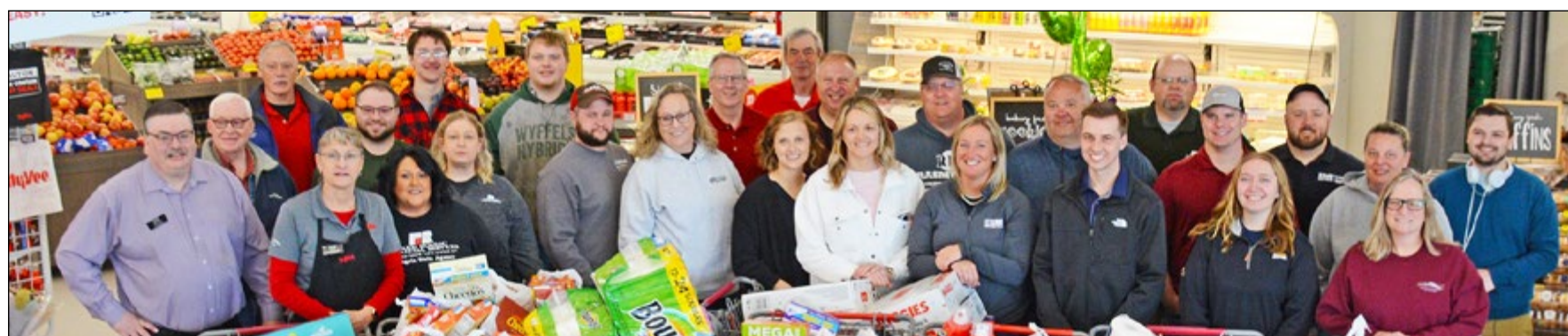
The contest participants and Farm Bureau representatives line up behind the carts full of items gathered for TAP.

All proceeds from the donations benefit the Norelius Community Library. Call 712-263-9355 for more information.