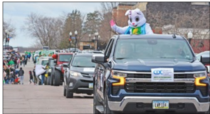
The Easter Bunny waves from the CDC entry.