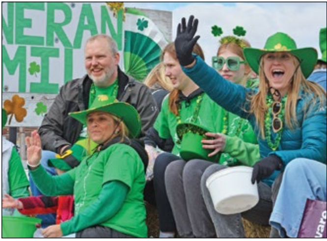
The St. Patrick's Day Parade in Denison featured well more than 40 entries with people on floats and parade watchers decked out in green. Pictured, members of the Fineran clan wave from their float.