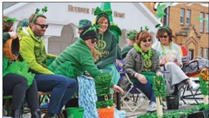
Hanigan family members smile and wave at parade watchers.