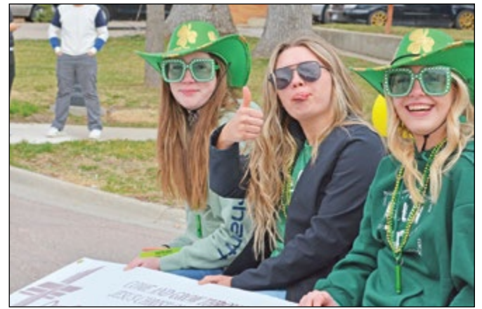
These girls in green were promoting vacation Bible school at Our Savior Lutheran Church.