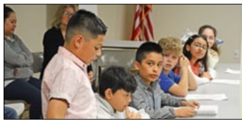
Legion essay contest