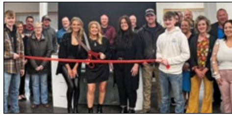
CDC ribbon cutting