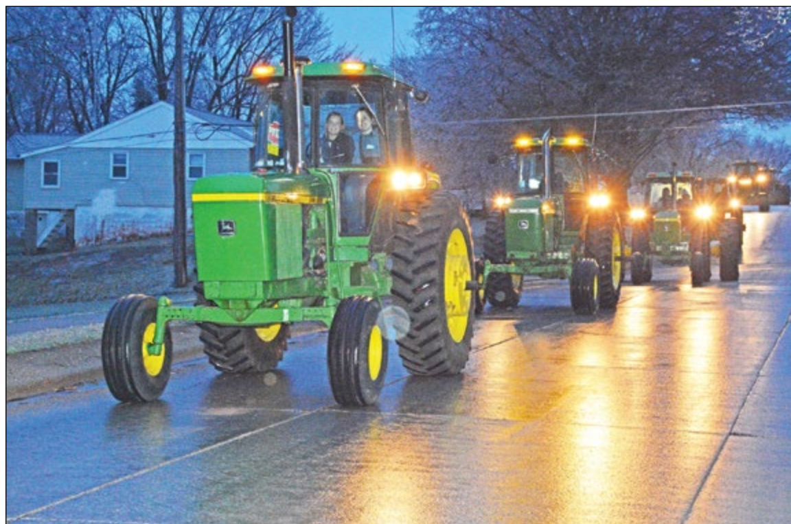
Engines sounded in Denison on Friday morning as more than 30 tractors drove through town, from Fareway to the high school parking lot, for the annual Denison FFA tractor drive. Pictured, tractors make their way up North 16th Street to the school.