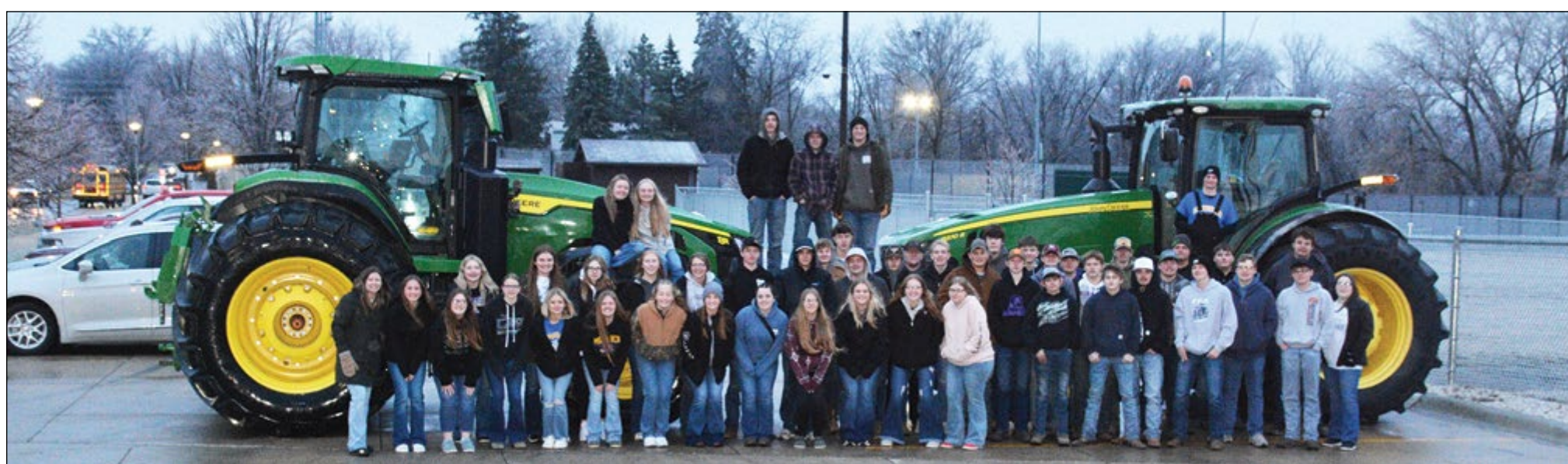
FFA members gather together in front of two tractors.