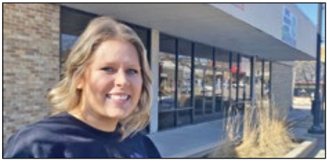
The Cottage is moving