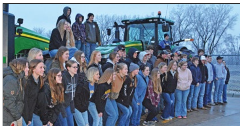
Students line up for the group picture.