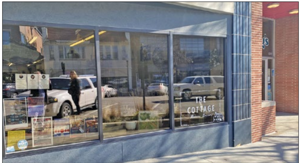
The front of the long-standing home-goods business location, for years The Treasure Chest, and more recently, The Cottage.