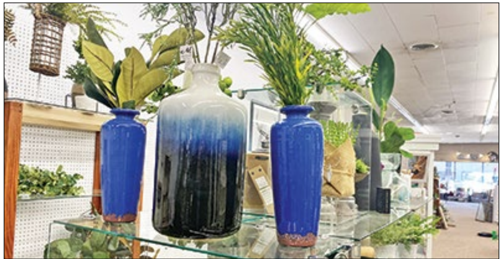
The Cottage is having a change-of-location sale in early April at its current spot, 1310 Broadway.

Besides the Borkowskis The Cottage has two part-time salespeople: Brandi Krajicek and Tina Gress.