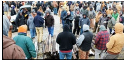
Spring consignment sale