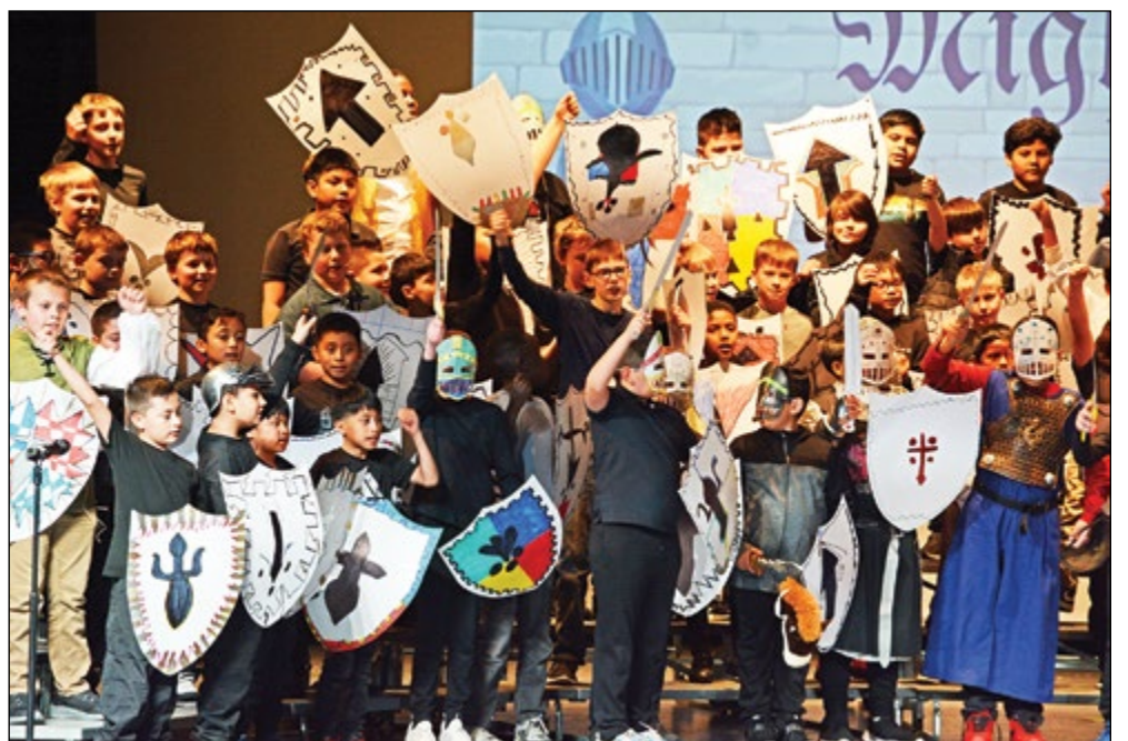
The Mighty Medieval Men raise up their swords during the song “Mighty Medieval Men.”