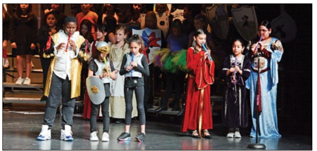
The soldiers, king and ladies from France arrive not with swords but with their own musical instruments.