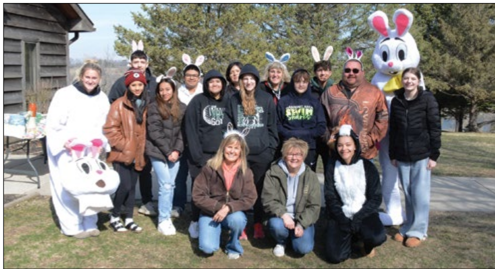
Two Easter bunnies and the Easter skunk pose with the helpers at the Easter egg hunt.