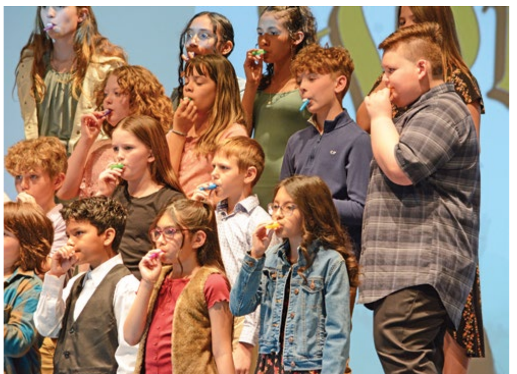
Kazoos were added to the Musical Monarchs’ performance of the song “The Kazoo Koncerto.”