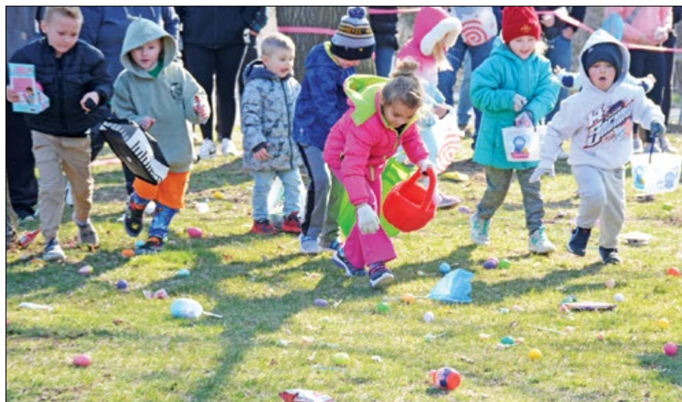
Children scramble to pick up Easter eggs and prizes in front of the nature center at Yellow Smoke Park on Saturday. It did not take long after the start of the event for the ground to be cleared of all eggs and prizes.