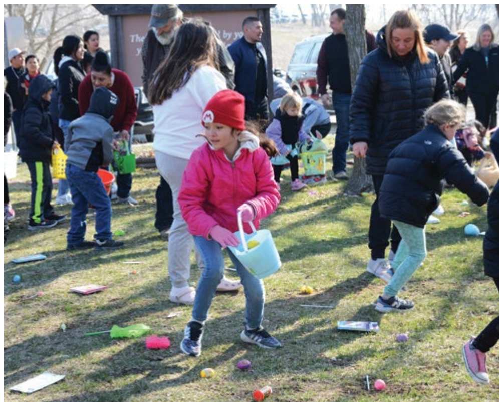
With activity swirling around her, a girl pauses to look for more eggs to gather.