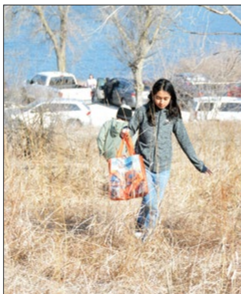
A girl searches the tall grass in front of the nature center to find any eggs that remain.