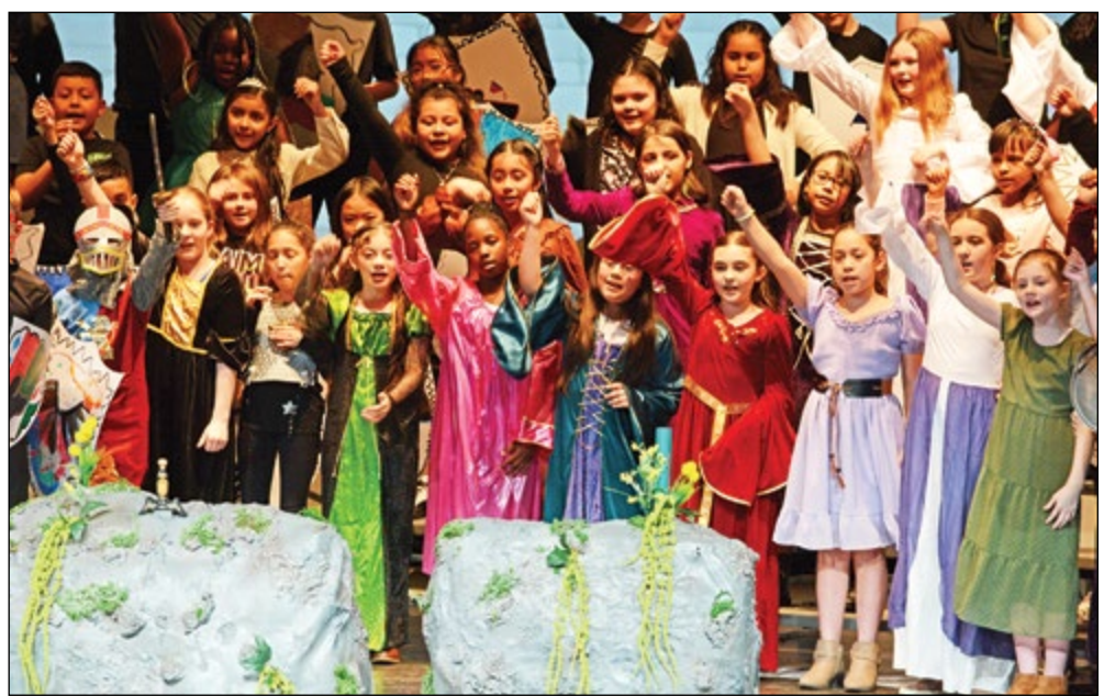
The ladies of King Arthur’s court perform during the song “Mighty Medieval Men.”