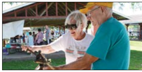
Raiders of the Lost Art