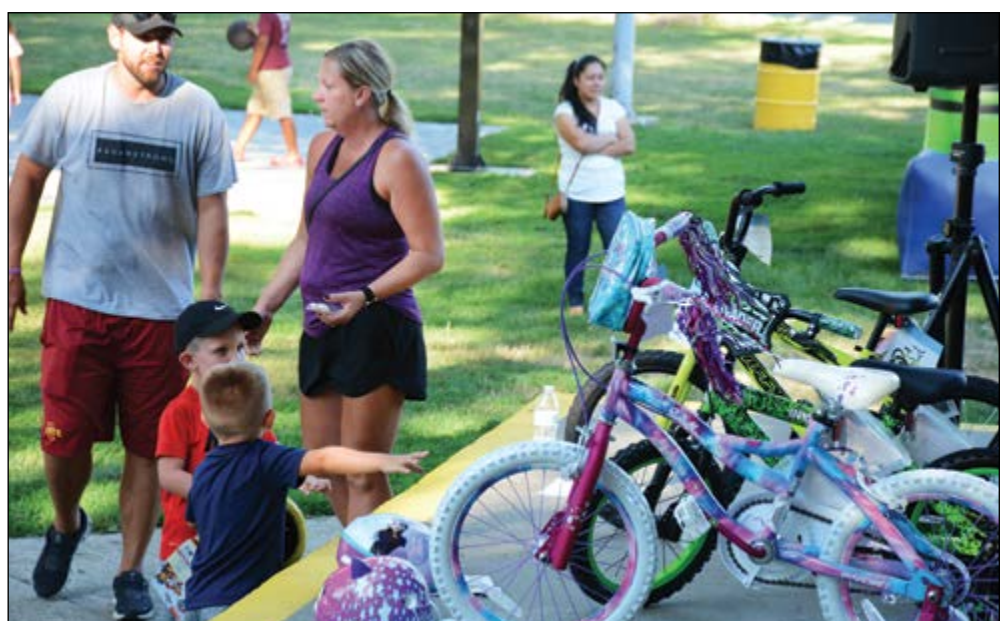
This youngster's name was drawn and he was quick to point out to his father which bike he wanted.