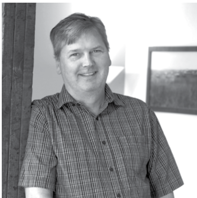
Dan Mundt News & Feature Writer