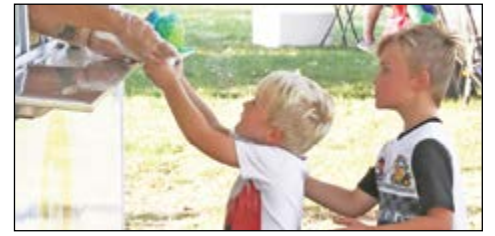
Movies in the Park