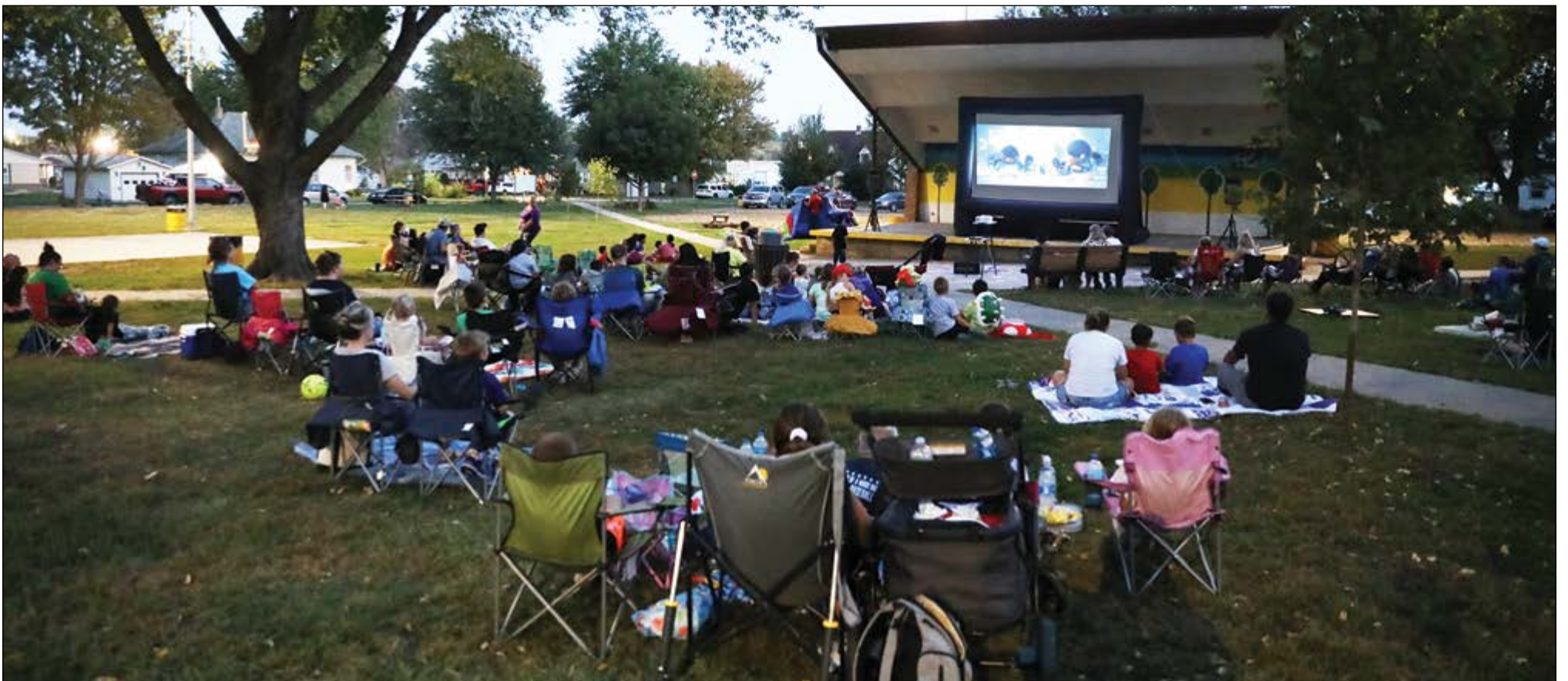
A good crowd settled in as "The Super Mario Bros. Movie" began at dusk.