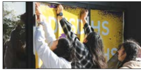
It's a wrap