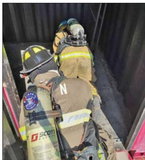
Cody Boger (Kiron) and Natya Sturm (Deloit) practiced search and rescue using the added realism the training center is able to provide. Firefighter I students must learn a standard search method designated by the Iowa Fire Service Training Bureau in order to gain certification. After testing on the basics, local firefighters are encouraged to learn more advanced skills that align with the standard operating procedures of their individual departments.