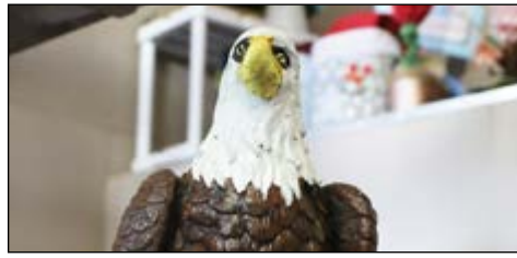
Sweet Freedom Creations